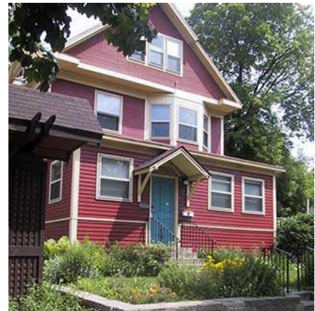
St. Joseph's Women's Shelter – Minneapolis, MN