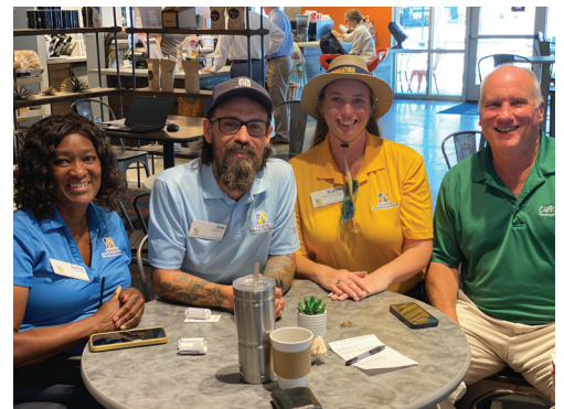
Breadcoin distributor Tampa Downtown Partnerships Clean Team + guest

Tampa’s lead food vendor - Portico Café, is generously supported by Breadcoin donors, including Tampa Downtown Partnership, a donor and distributor of Breadcoins in downtown Tampa.