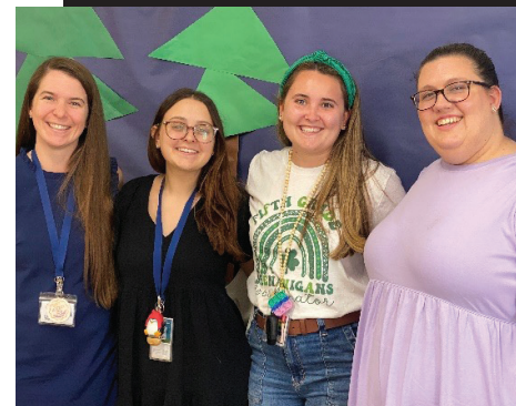
West Shore Elementary