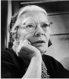
Servant of God Dorothy Day

Vision - “Make the kind of society where it is easier to be good.” – Peter Maurin Mission - Recruit and train volunteers in a Catholic Worker tradition, who recognize the dignity of each person, to provide relief, hospitality, and housing assistance to homeless men and women within the Tampa area.