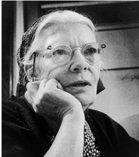
Servant of God Dorothy Day

Vision - "Make the kind of society where it is easier to be good." – Peter Maurin Mission - Recruit and train volunteers in a Catholic Worker tradition, who recognize the dignity of each person, to provide relief, hospitality, and housing assistance to homeless men and women within the Tampa area. Core Values - "The Sermon on the Mount is our Christian manifesto" – Dorothy Day Ministry Overview: www.catholicworker.org