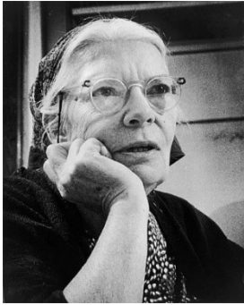
Servant of God Dorothy Day

Vision - "Make the kind of society where it is easier to be good." – Peter Maurin Mission - Mobilize and train Catholic Workers to live the Gospel courageously and aid the poor differently .