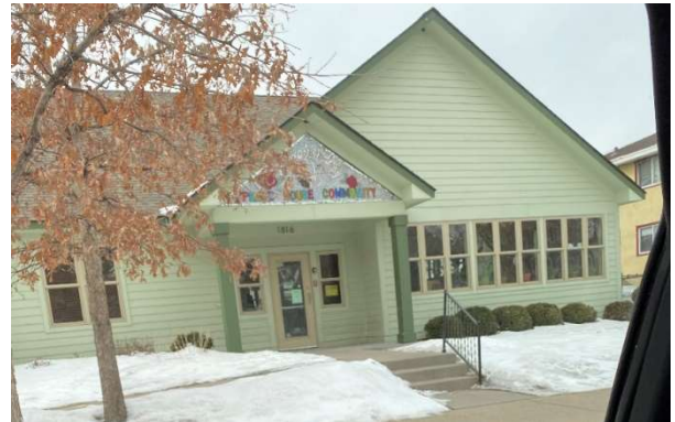
Peace House Community | Minneapolis, MN

We are grateful for a 3/9/2022 decision to proceed with developing Phase One of Dorothy Day Tampa (DDT). The group consensus: start with a homeless drop-in center and build our ministry from there. We plan on replicating best practices of Minneapolis, MN's Peace House Community (PHC) www.peacehousecommunity.org .