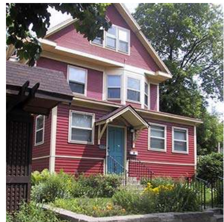
St. Joseph’s Women’s Shelter – Minneapolis MN