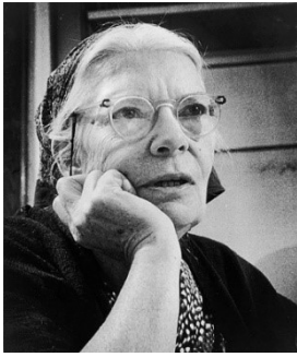
Servant of God Dorothy Day

Vision - “Make the kind of society where it is easier to be good.” – Peter Maurin